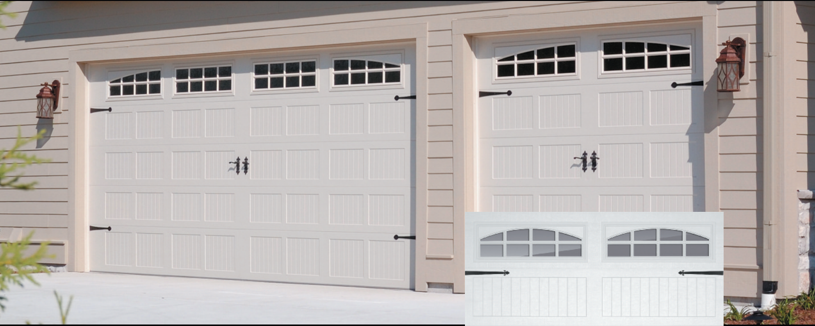
Pictured. 16' x 8' 5251 almond with optional 4p arched stockton inserts and wrought iron hardware; 9' x 8' 5251 almond with optional arched stockton inserts and wrought iron hardware