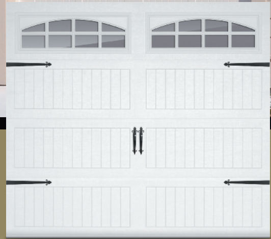
8' x 7' 5950 white with optional tinted glass, cascade window inserts and barcelona hardware